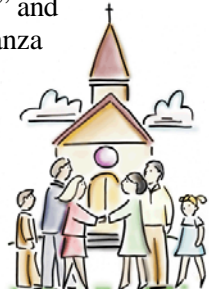
Invite a Neighbor to Church

You will be receiving information about this in the mail in May but mark it on your calendar and start inviting neighbors and friends to join you on that day.