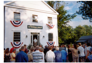
Grand Opening 7/11/2003