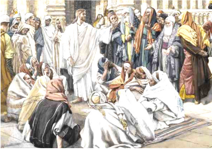
The Pharisees Question Jesus by James Tissot