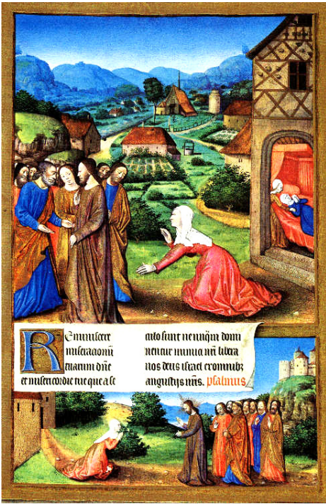
The Syro-Phoenician Woman Jean Colombe

Holy Eucharist: Rite I — 8:00 AM St. Peter's Church, Salem