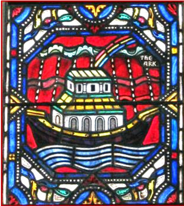
The Noah Window Grace Church

The Holy Eucharist: Rite II — 8:00 AM The Holy Eucharist with Baptism — 10:30 AM