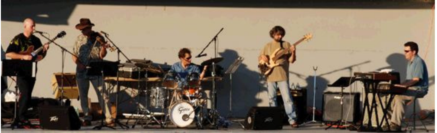
Outta Scope in performance on the grounds of Montpelier Mansion, July 13, 2007

OUTTA SCOPE is one of the hottest and most innovative jazz-rock groups in the Washington, D.C. area. The lineup features unique instrumentation that includes 5-string electric viola, piano and Hammond organ, guitar, bass, and drums played by some of the hottest musicians in the Nation's Capital. Outta Scope plays upbeat and sophisticated music with no boundaries and with an emphasis on the groove. And groove they do, through contemporary jazz to classic rock to New Orleans funk to bluegrass to swing. Combining originals and covers, including tunes off of their debut CD "Time Machine", Outta Scope is truly "A BAND FOR ALL SEASONS AND ALL REASONS."