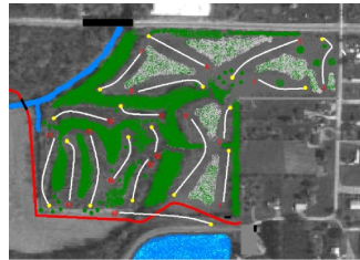
Aerial View of USRPDGC

We have hopes of a speedy back nine as well as a tournament in the not so distant