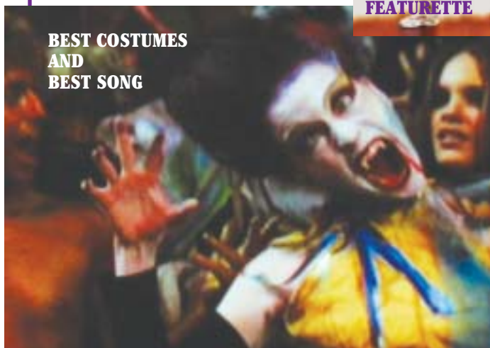
BEST COSTUMES AND BEST SONG

BEST FILM - The Apple (above) received votes by the bushel as one of the most rotten to the core films we've ever shown.