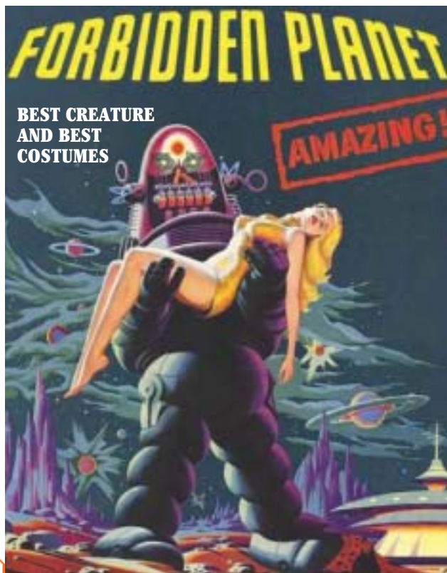
BEST CREATURE AND BEST COSTUMES

BEST CREATURE - The 1950s was the golden age of creature features, so it's no surprise that Robby the Robot from 1956's Forbidden Planet takes this category.