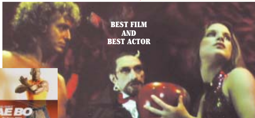
BEST FILM AND BEST ACTOR