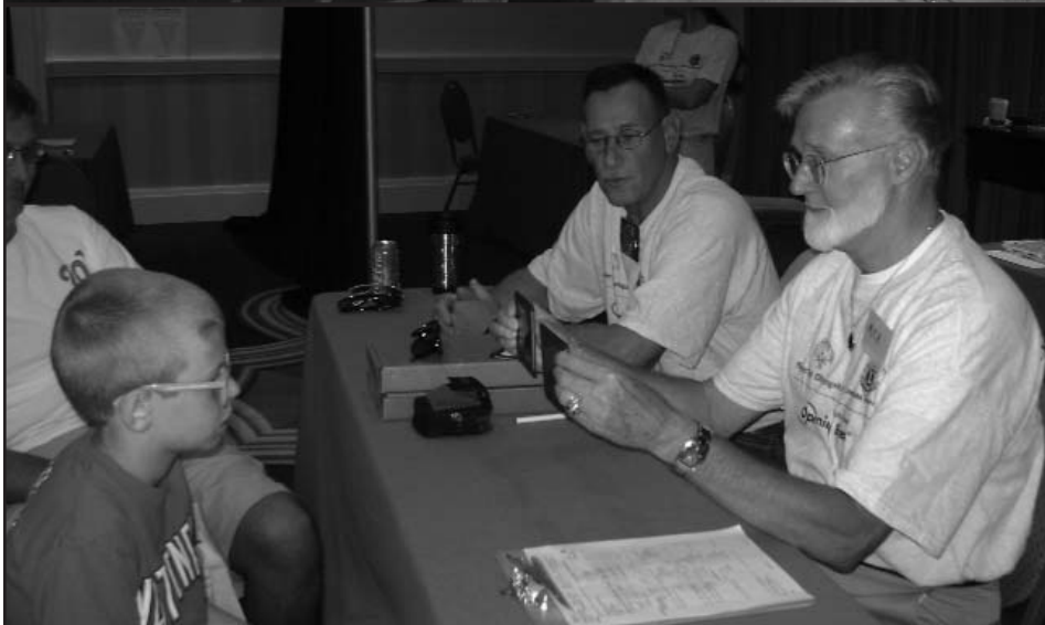
Top Left: Tables of eyeglasses to choose from; one athlete being fitted for a pair of eyeglasses.