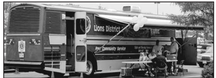
The Mobile Health Unit was a valuable asset in making the screening event visible and accessible to the public.