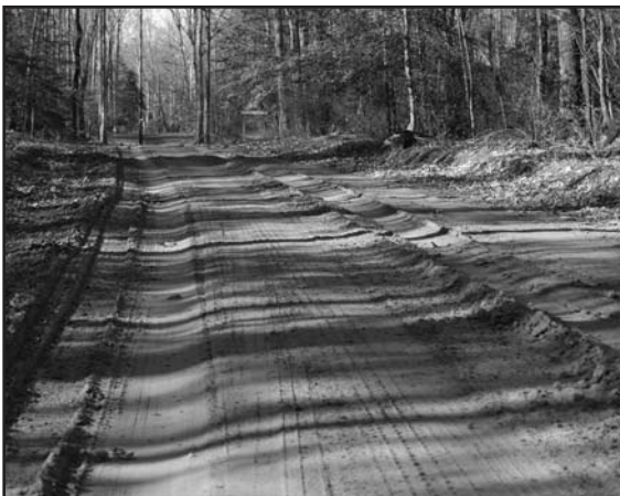
Before and after shots of the entrance road to LCM