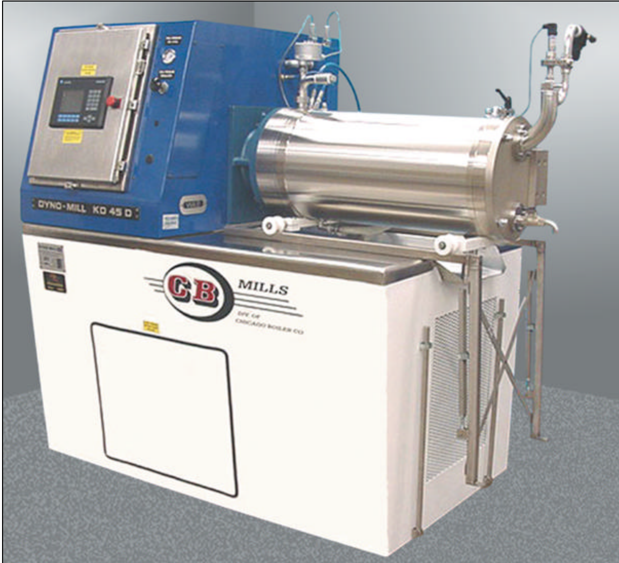
Model shown is the KD 45D.