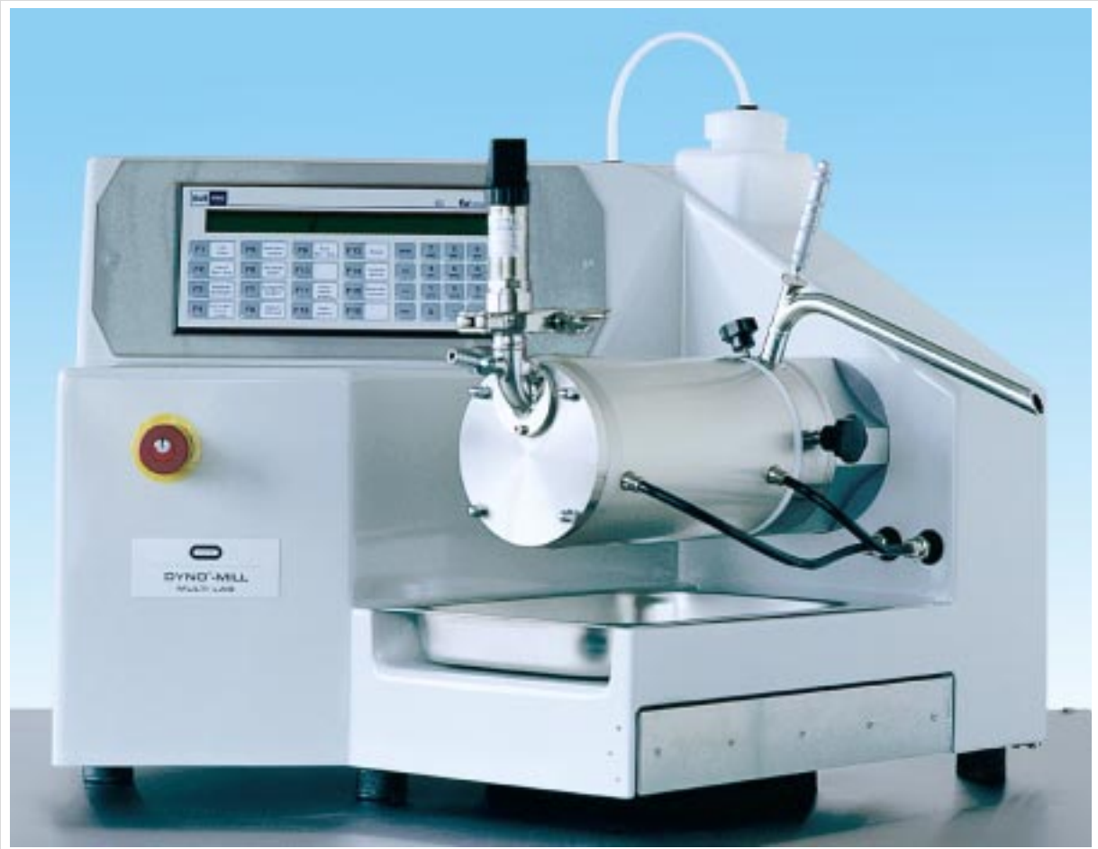
Multi-Lab shown with PLC option

Multi-Lab is the ultimate all-purpose mill for research and small batch applications.