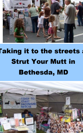
Taking it to the streets at Strut Your Mutt in Bethesda, MD