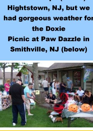
It was a cold & windy day at the Hair of the Dog 5K Run & Pet Expo (above) in Hightstown, NJ, but we had gorgeous weather for the Doxie Picnic at Paw Dazzle in Smithville, NJ (below)